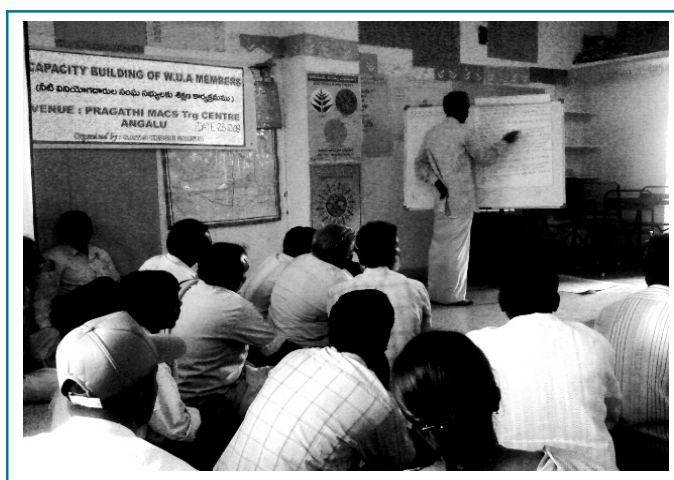
1 st Training: December, 2008

This training was aimed at improving the knowledge and awareness level amongst the WUA members; about the existing situation of their tanks and water management systems, livelihoods, cropping pattern; roles and responsibilities of the WUAs; to strengthen their awareness of APFMIS Act-1997; to identify the issues to be worked out in future and to create awareness on various government schemes being implemented by the departments like agriculture, horticulture, animal husbandry etc.